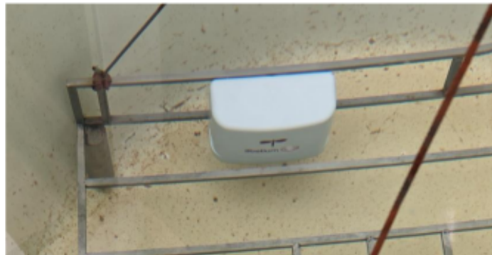
Sample during IPX8 test