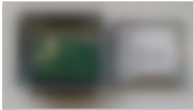
Detail after test