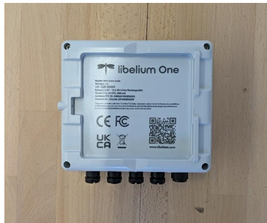
Sample type under test